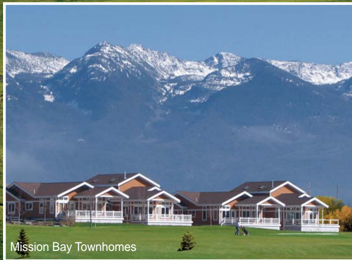
Mission Bay Townhomes

The newest neighborhood is Mission Bay Village, open to residents this summer. The Village is an entirely new setting created to accommodate the demand for Flathead Lake living at an affordable price. Like all the neighborhoods in Mission Bay, The Village plan stresses the creative use of open space. Homes will have a sense of openness to the surroundings with a series of short courtyards and cul-de-sacs to reduce noise and traffic.