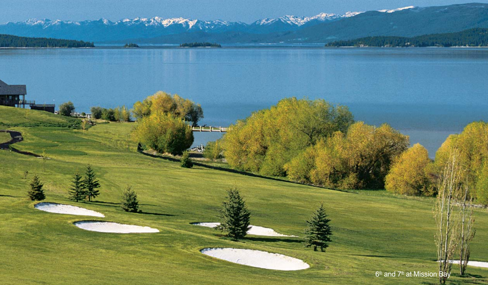
6 th and 7 th at Mission Bay