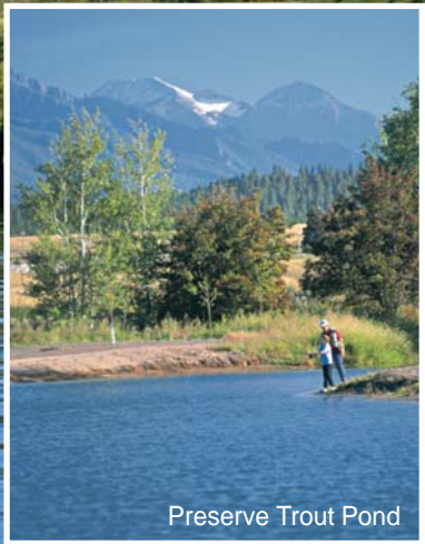
Mission Bay Preserve