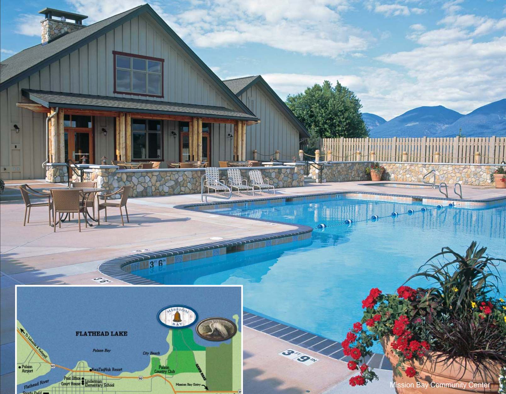
Mission Bay Community Center