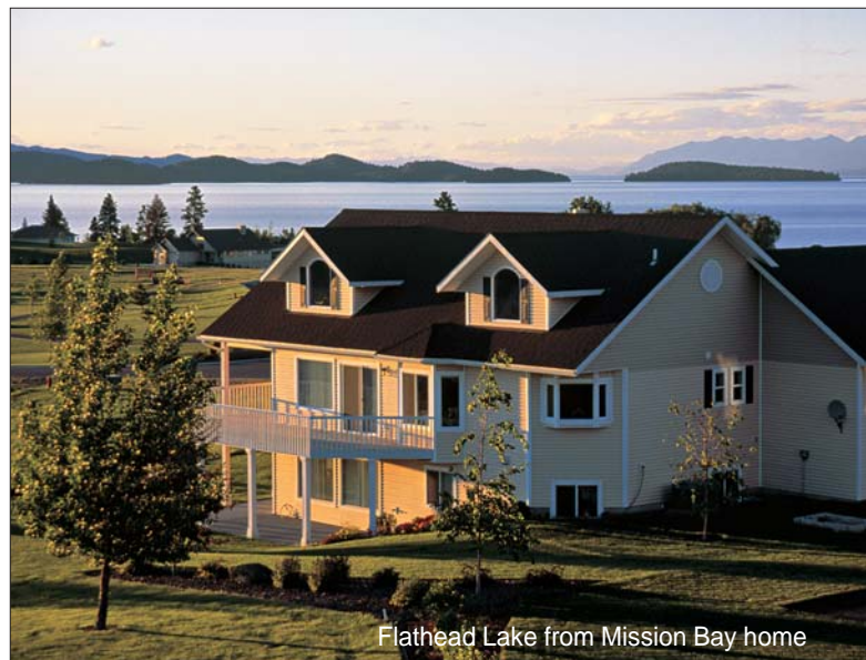
Flathead Lake from Mission Bay home