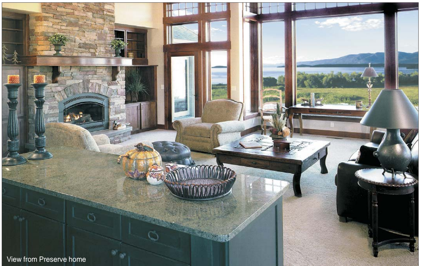
View from Preserve home

Polson itself is a charming, lakefront town with a pleasant variety of galleries, shops, lakefront parks, playgrounds, restaurants, and markets. Its diverse lifestyle includes art shows, summer theaters, arts and crafts festivals, rodeos, and county fairs. Summer annual events include Cruising by the Bay Classic Car Show, Hoopfest 3 on 3 basketball tournament and The Mack Attack fishing derby. The newly expanded St. Joseph's Hospital and Medical Center provides a broad range of advanced health care and emergency services.