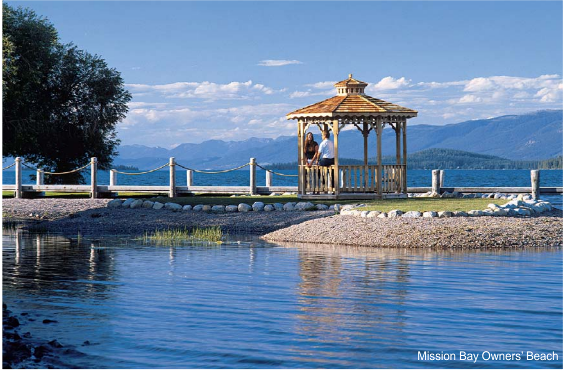
Mission Bay Owners' Beach