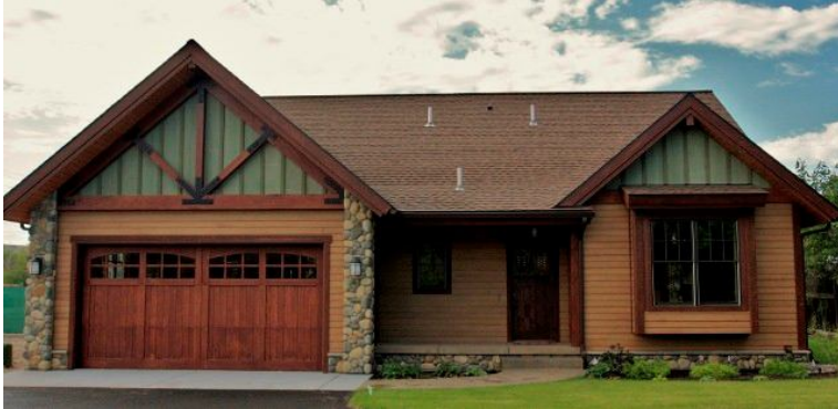
River Landing Cabin

A new enthusiasm seems to be brewing for 2010. We here in Mission Bay Realty have definitely experienced a renewed interest in real estate. The folks I have been talking with believe that we are at or at least close to the bottom of the market and are concerned that interest rates will be taking a hike in the near future. The Federal government is offering tax breaks through April and there is a great supply of homes and land with willing sellers. We in the business call this a Buyer's Market, and people are shaking off the winter blues and coming out to take advantage of the large inventory and low interest rates.