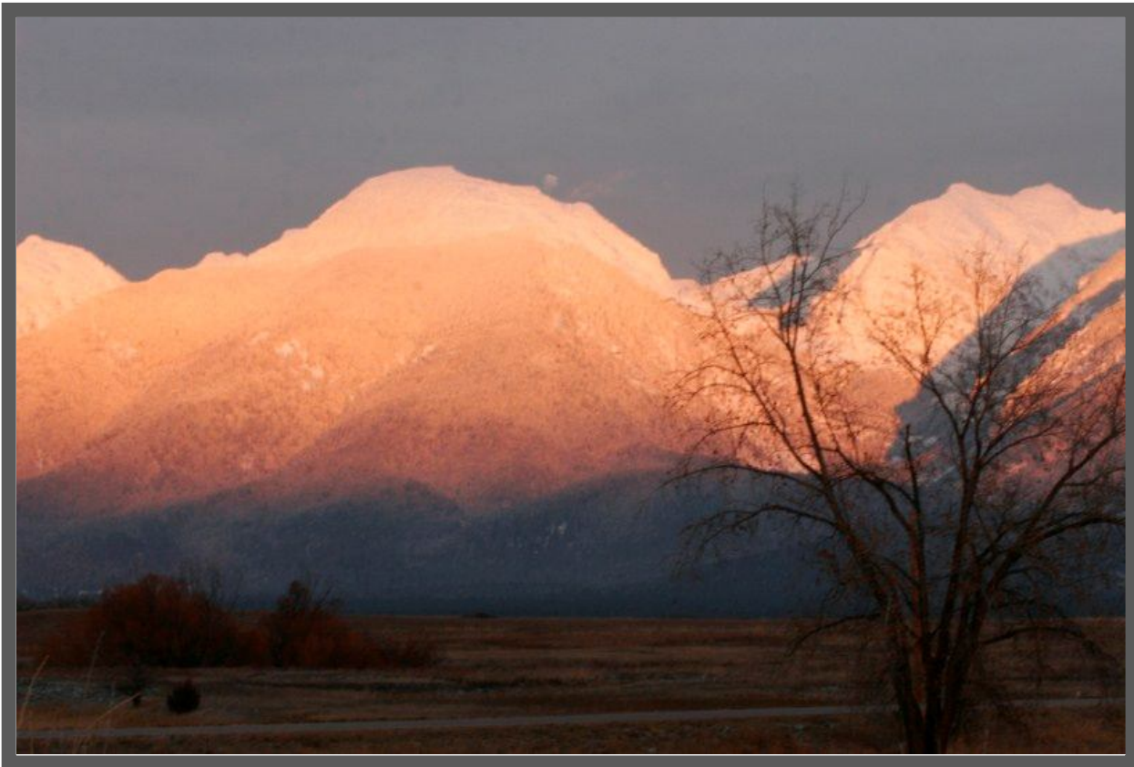
Mission Mountains near Ronan

Hope you enjoyed this issue of Mission Bay Splash. Please stop by with any real estate questions. We'd love to assist you however we can. See you soon.