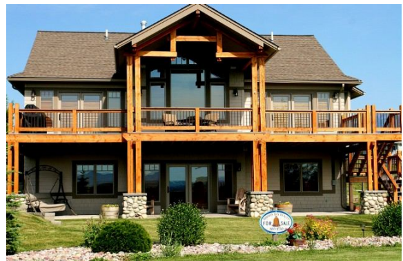
Mission Bay Cottage on the Golf Course

great family, and that we should not take our good health for granted. I thank everyone who has been so kind this past year, offering encouragement even though you have been facing your own set of challenges.