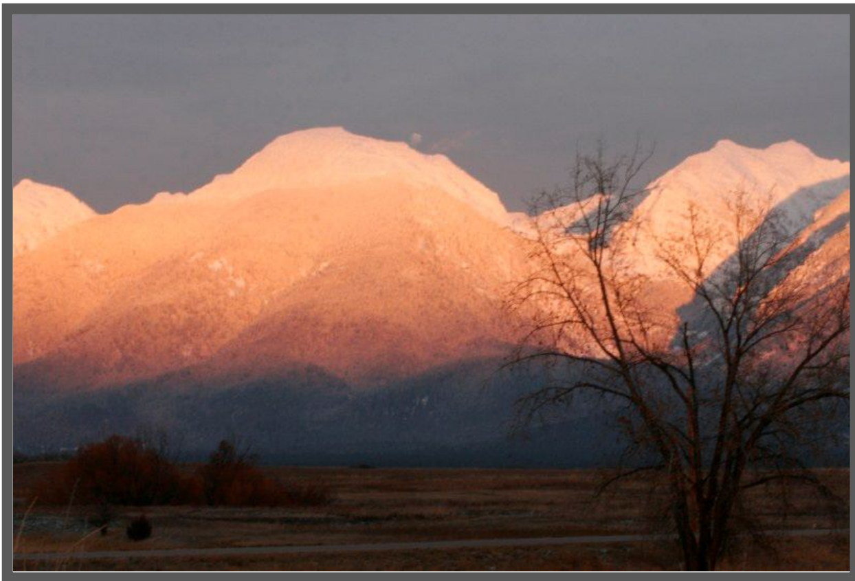
Mission Mountains near Ronan

Hope you enjoyed this issue of Mission Bay Splash. Please stop by with any real estate questions. We'd love to assist you however we can. See you soon.